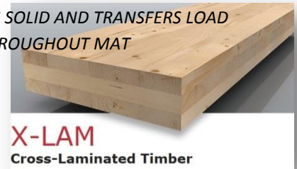
X-LAM Cross-Laminated Timber